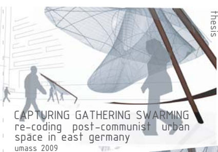
CAPTURING GATHERING SWARMING re-coding post-communist urban space in east germany umass 2009