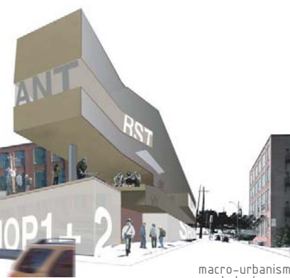
macro-urbanism holyoke, ma umass 08

Went to a number of schools, which all infused me with their own meaning on design and architecture: Dutch super-modernism, conceptual, social responsibility, critical theory - which led me to approach architecture and design anew over and over again.