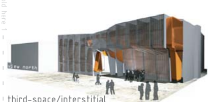
third-space/interstitial boston, ma umass 08