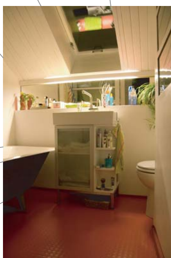
dry wall, stucco, low budget, 38 sq ft